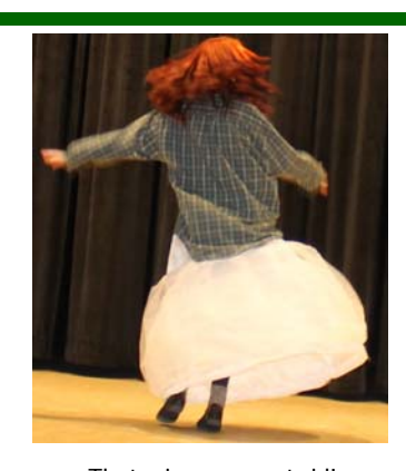
That princess can twirl!