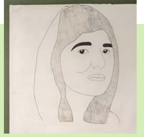
Meet Middle School Motivator of the Month: Malala Yousifizia